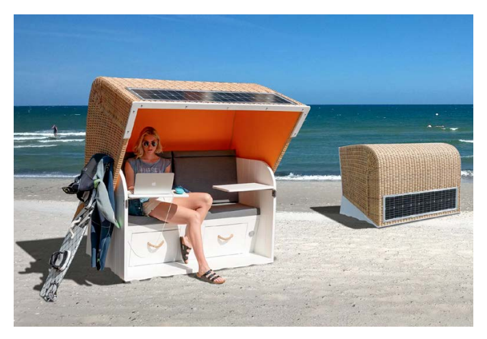
The solar beach chair makes it possible to live and work directly by the sea.

Members not only demonstrate this level of dedication and commitment in the specialist groups but also in the collaborations and projects that DiWiSH Cluster Management organises as a project partner, such as the "Care AI" project, for